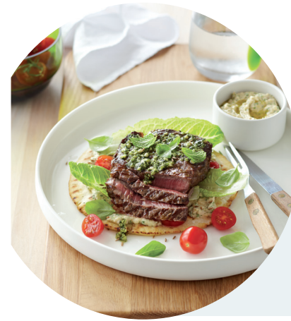
BARBECUED STEAKS WITH BABA GHANOUSH & TOMATO SALAD