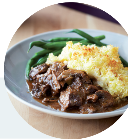
BEEF AND POTATO TOP BAKE