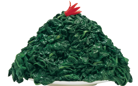
19 CUPS COOKED SILVERBEET