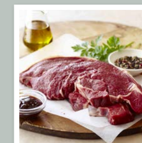
Beef rump steaks

The following cuts also work well in this recipe.