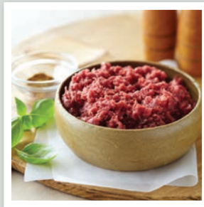
Lamb or beef mince