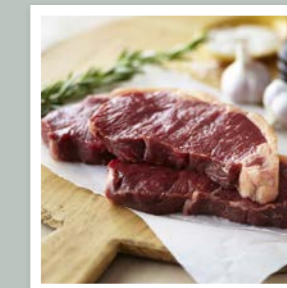
Beef sirloin steaks

The following cuts also work well in this recipe.