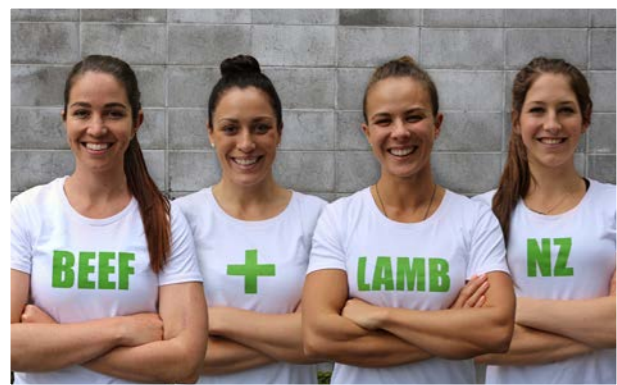
Iron Maidens from left to right: Sarah Walker, Sophie Pascoe, Lisa Carrington and Eliza McCartney

Sarah Walker's journey to Rio was slightly different to the others; her flights were booked, bags were packed and she departed NZ, just hours after being invited to join other top athletes on the International Olympic Committee. "Being invited onto the committee was a huge privilege and it was an incredible experience being in Rio. Being there and not being able to compete made me realise I am not ready to give up on BMX just yet and I'm ridiculously excited to start training again," says Walker.