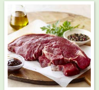
Beef rump steaks

The following cut also works well in this recipe.