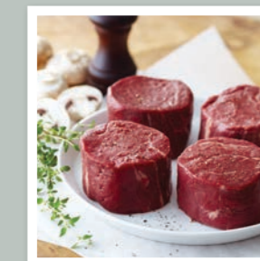
Beef eye fillet steaks