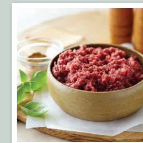
Beef or lamb mince