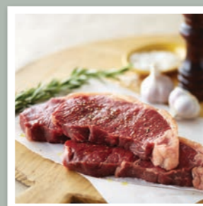
Beef sirloin steaks